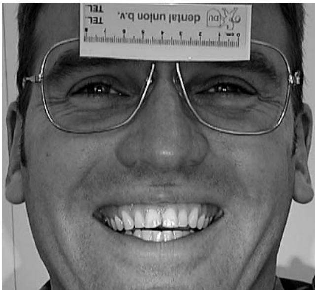
Figure 2. Spontaneous photograph of the participant smiling made using the digital videographic method.

the maxilla. Using a within-person mean score to express the smile line would result in an incorrect view, as the heights of the smile line between the teeth of a person can differ considerably.